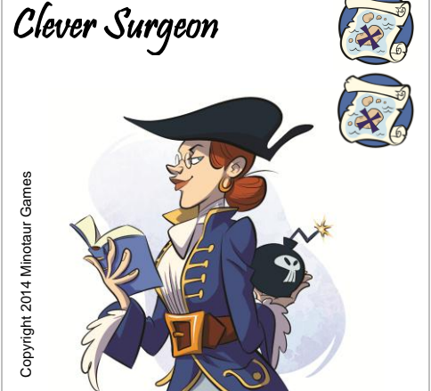
Clever 2 Recruit: Select one card in the discard pile. Recruit that card.