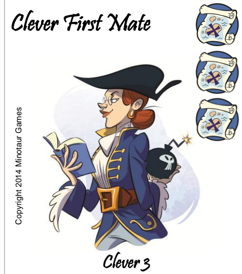
Recruit : Draw a number of cards equal to the number of players and put them back on top of the draw deck in any order