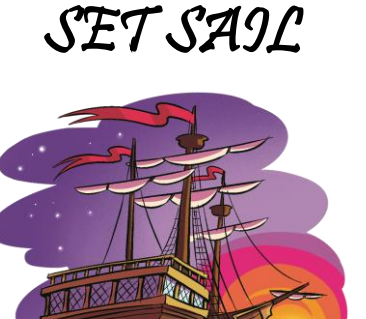
All players take one more turn and then divvy the haul.